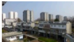
Thamesmead where scenes for MotherFatherSon were filmed

Residents of Thamesmead (shown in photo) also benefited, as fees from filming go to Thamesmead 50th fund, ensuring that filming activity directly benefits the local community.