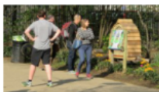
Russell Square Bug Hotel

They also filmed on Eton Avenue and donated to the Save Swiss Cottage Action Group. On Russell Square, Senate House, was the setting of an army base and the production made donations to the Bloomsbury Association and residents of Russell Square. The residents of Russell Square have the ambition to increase the Bio-diversity within Russell Square Gardens and recently installed insect hotels in the gardens.