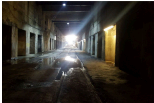
One of the joys of working across the Film Offices [...]

Working with Unique Locations Posted on 28th September 2020 by FilmFixer